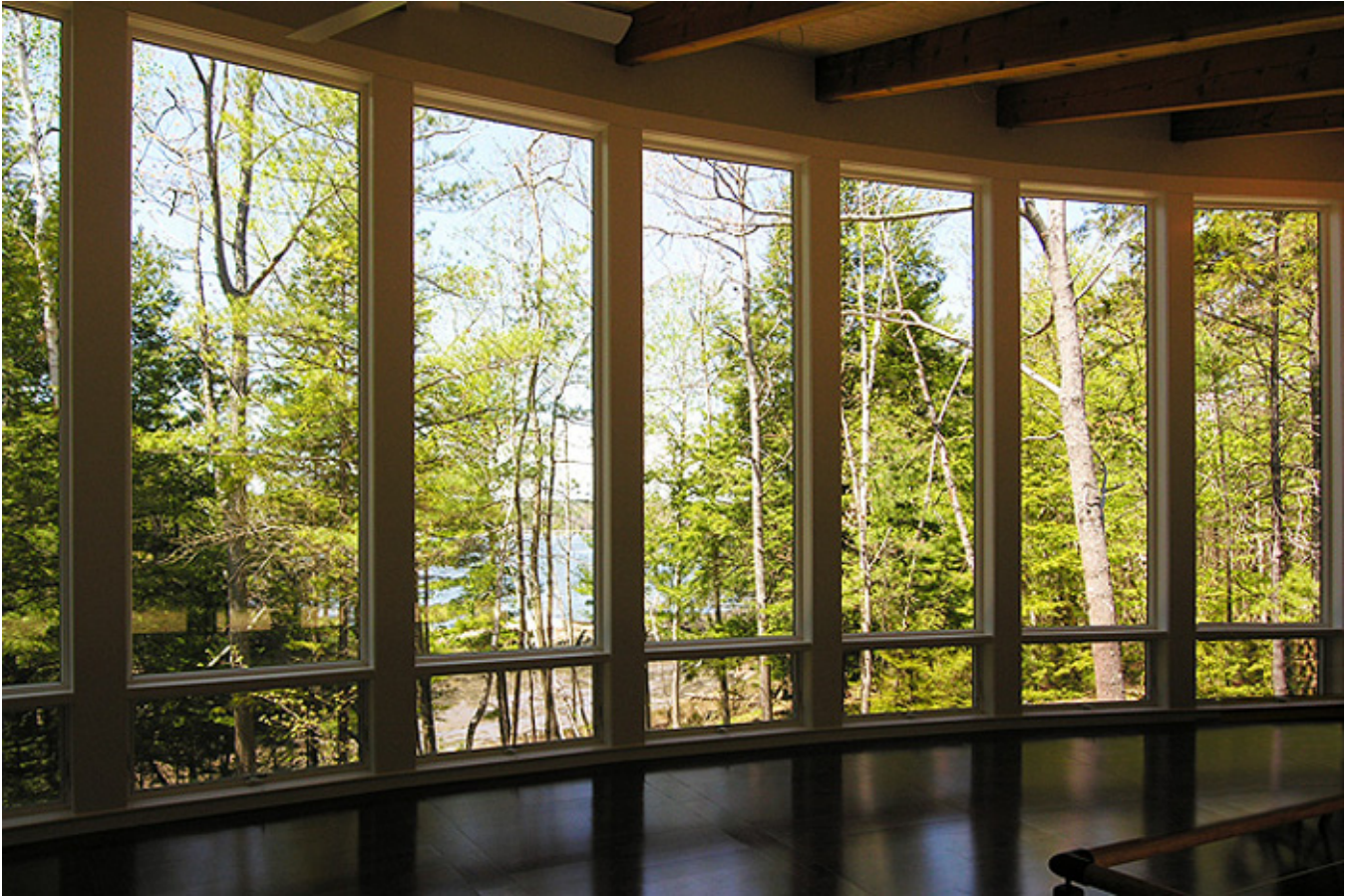
Cowseagan Cottage - Completed in 2006.